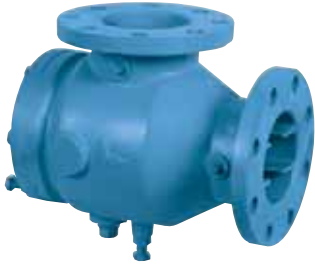
Type YSD-1, 2, 3