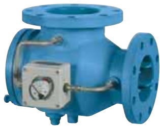
Type YSD-1, 2, 3R